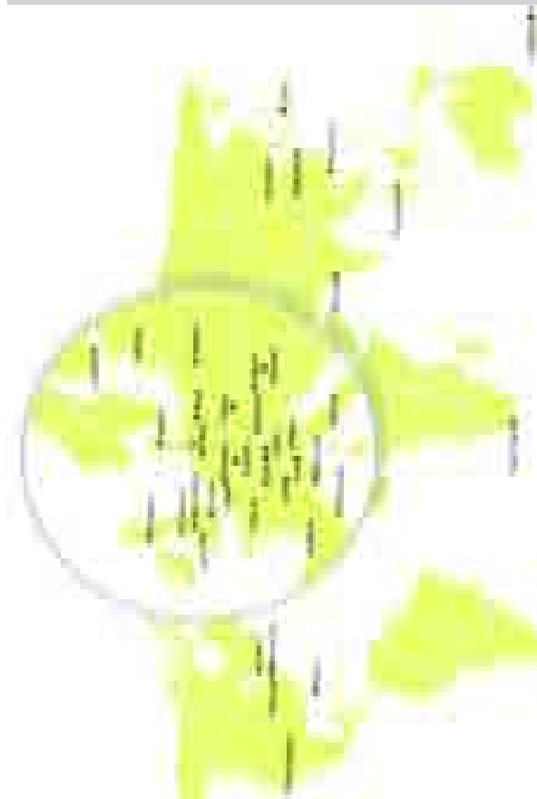
Figure 1. Map of selected local economies

Comments and suggestions from local authorities not only informed our analysis but also shaped how and what analysis is presented in this document. For instance, as a result of helpful discussions with certain local leaders we have omitted material thought to lack robustness and focussed on material which is more informative.